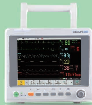
iM60 Patient Monitor